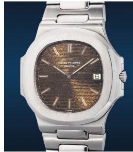
872 Patek Philippe A rare, superbly attractive and s... Estimate HK$620,000 — 1,240,000