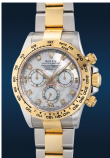
866 Rolex A fine and attractive two tone y... Estimate HK$80,000 — 160,000