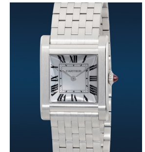
830 Cartier A “brand-new” stunning, rare a... Estimate HK$320,000 — 640,000