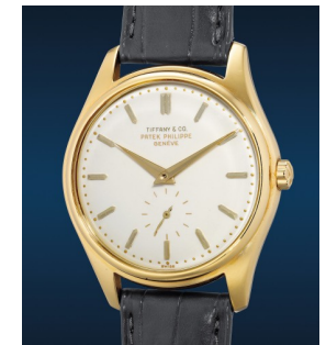
900 Patek Philippe An elegant and extremely rare y... Estimate HK$390,000 — 800,000