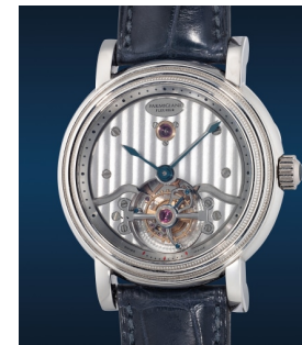
1009 Parmigiani An exceptionally rare and exqui... Estimate HK$400,000 — 800,000