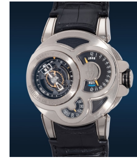
894 Harry Winston A very rare and avant-garde lim... Estimate HK$480,000 — 960,000