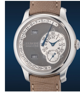
1004 F.P. Journe A very rare and exceptional limit... Estimate HK$480,000 — 950,000