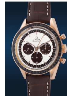
879 Omega A fine and attractive pink gold c... Estimate HK$65,000 — 130,000