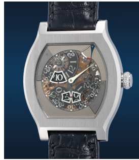
972 E.P. Journe A very rare and fine limited editi... Estimate HK$620,000 — 1,250,000