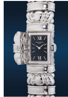
993 Patek Philippe A rare and unusual white gold w... Estimate HK$150,000 — 250,000