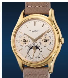
856 Patek Philippe An early, attractive and rare "fir... Estimate HK$350,000 — 700,000