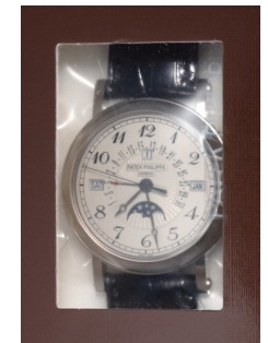
930 Patek Philippe An untouched, highly attractive ... Estimate HK$200,000 — 400,000