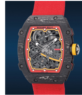
824 Richard Mille A highly desirable and attractiv... Estimate HK$1,300,000 — 2,200,000