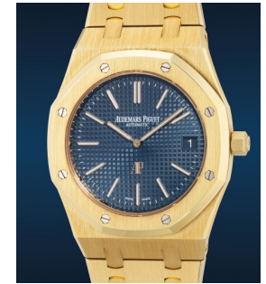
915 Audemars Piguet A sought-after, rare and well-pr... Estimate HK$400,000 — 780,000