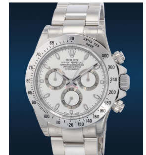
940 Rolex A well-preserved and rare stainl... Estimate HK$100,000 — 200,000