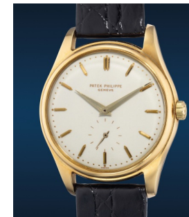
989 Patek Philippe An extremely elegant, refined a... Estimate HK$150,000 — 250,000