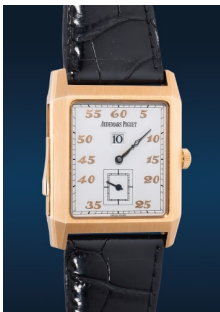
826 Audemars Piguet A fine and attractive pink gold r... Estimate HK$200,000 — 300,000