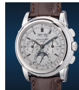
810 Patek Philippe A very fine and attractive white ... Estimate HK$800,000 — 1,400,000