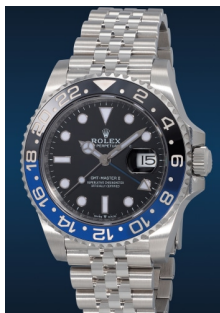
802 Rolex A "like-new" and sought-after s... Estimate HK$50,000 — 100,000