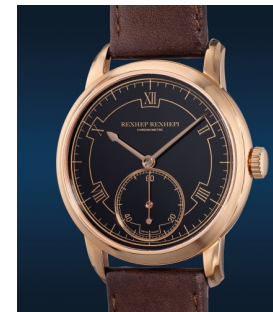
939 Rexhep Rexhepi An impressive, exceptionally rar... Estimate HK$1,600,000 — 3,000,000