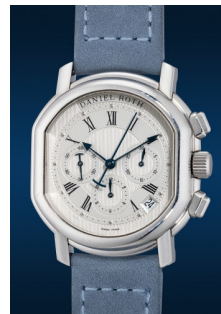
968 Daniel Roth A fine and attractive stainless st... Estimate HK$70,000 — 120,000