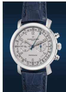
917 Vacheron Constantin A rare, large and attractive limit... Estimate HK$120,000 — 220,000