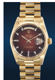
959 Rolex A very fine and rare yellow gold ... Estimate HK$120,000 — 240,000