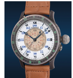
870 Longines A fine and rare silver pilot's wris... Estimate HK$150,000 — 250,000