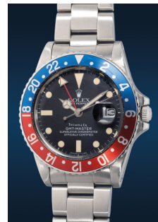
897 Rolex A very rare and well-preserved s... Estimate HK$100,000 — 200,000