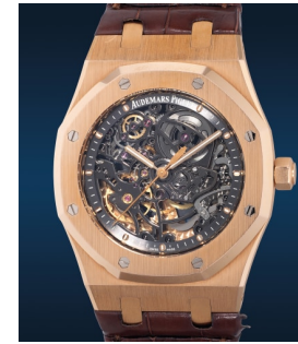
814 Audemars Piguet An extremely attractive and rar... Estimate HK$400,000 — 800,000