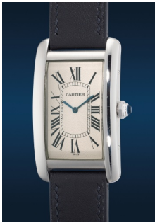
971 Cartier A fine and attractive oversized p... Estimate HK$80,000 — 160,000

Hong Kong Auction / 24 November 2023 / 3pm HKT