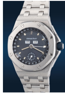
813 Audemars Piguet A fine and attractive stainless st... Estimate HK$60,000 — 120,000