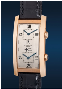
821 Cartier A highly rare, exceptional and “... Estimate HK$200,000 — 300,000

Hong Kong Auction / 24 November 2023 / 3pm HKT