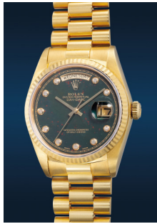
942 Rolex A highly rare, well-preserved an... Estimate HK$150,000 — 250,000