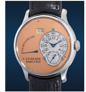
925 F.P. Journe An extremely rare, early and hig... Estimate HK$500,000 — 800,000