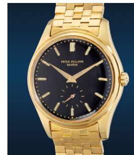
854 Patek Philippe An extremely rare and highly att... Estimate HK$700,000 — 1,400,000