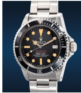
832 Rolex An incredible, beautifully preser... Estimate HK$400,000 — 800,000