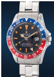
896 Rolex A well preserved and rare stainl... Estimate HK$80,000 — 160,000