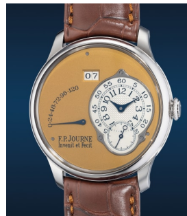
818 F.P. Journe A emblematic limited edition st... Estimate HK$320,000 — 640,000