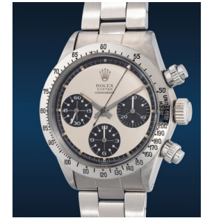
875 Rolex A well-preserved, rare and attra... Estimate HK$2,750,000 — 4,300,000