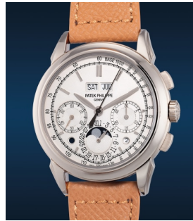
932 Patek Philippe An extremely rare and attractiv... Estimate HK$550,000 — 1,100,000