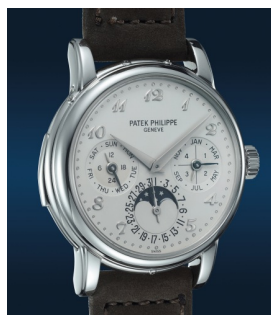
858 Patek Philippe A superbly attractive, highly im... Estimate HK$8,800,000 — 17,600,000