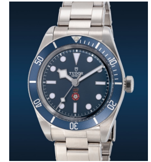
975 Tudor A fine and rare limited edition st... Estimate HK$60,000 — 120,000