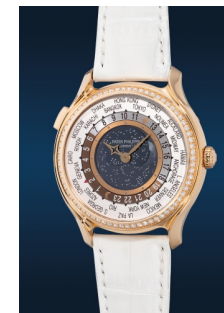
955 Patek Philippe A lady's highly attractive and co... Estimate HK$400,000 — 800,000