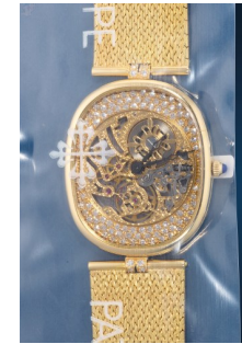
994 Patek Philippe A rare and attractive yellow gol... Estimate HK$65,000 — 150,000