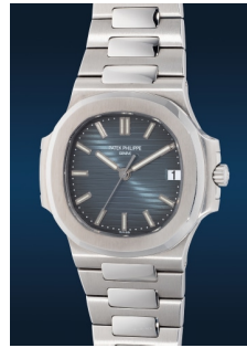
982 Patek Philippe A very fine and rare stainless ste... Estimate HK$380,000 — 550,000