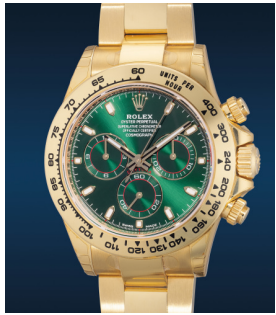
941 Rolex A rare and well-preserved yellow... Estimate HK$320,000 — 630,000

Hong Kong Auction / 24 November 2023 / 3pm HKT