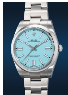
803 Rolex An attractive, sought-after and ... Estimate HK$50,000 — 80,000