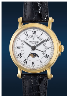
1006 Patek Philippe A very fine and attractive yellow... Estimate HK$200,000 — 280,000