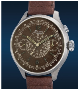
871 Minerva An early, oversized and highly a... Estimate HK$120,000 — 180,000

Hong Kong Auction / 24 November 2023 / 3pm HKT