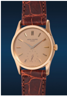
841 Patek Philippe A well-preserved and elegant pi... Estimate HK$80,000 — 160,000

Hong Kong Auction / 24 November 2023 / 3pm HKT