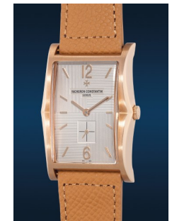
920 Vacheron Constantin A fine and attractive pink gold s... Estimate HK$120,000 — 200,000