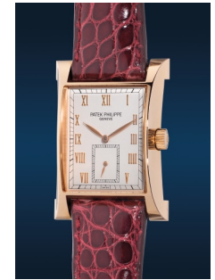
840 Patek Philippe A very fine and rare limited editi... Estimate HK$80,000 — 160,000