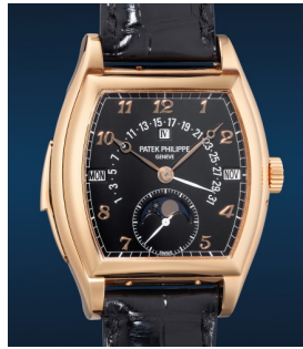
843 Patek Philippe An extremely attractive and rar... Estimate HK$2,300,000 — 3,900,000