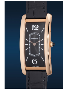
849 Cartier An elegant and attractive pink g... Estimate HK$100,000 — 200,000