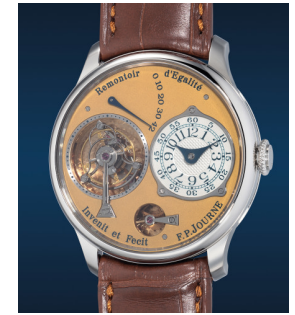
815 F.P. Journe A mechanically complex and hig... Estimate HK$1,200,000 — 2,400,000