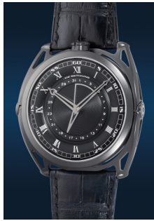
1002 De Bethune An impressive, rare and attracti... Estimate HK$235,000 — 470,000