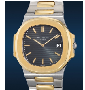
980 Patek Philippe A superbly well-preserved two-t... Estimate HK$310,000 — 630,000