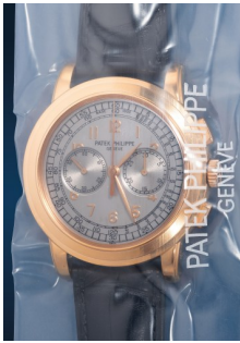
861 Patek Philippe A large, rare and attractive pink ... Estimate HK$310,000 — 600,000

Hong Kong Auction / 24 November 2023 / 3pm HKT