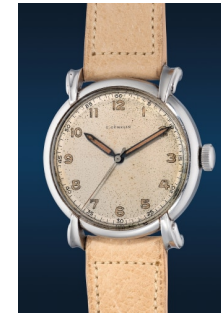
984 E. Gübelin A fine and rare stainless steel wr... Estimate HK$40,000 — 80,000