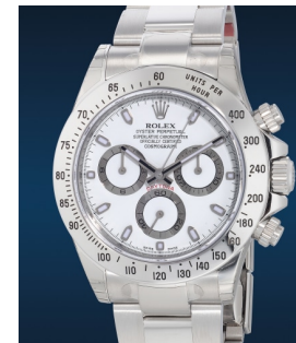
869 Rolex A highly rare, attractive and "lik... Estimate HK$240,000 — 500,000