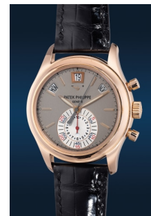
954 Patek Philippe A fine and attractive pink gold a... Estimate HK$220,000 — 420,000