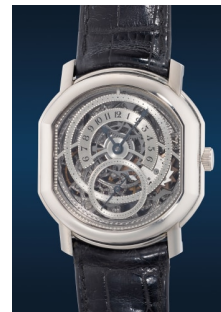
828 Daniel Roth A fine and rare white gold skelet... Estimate HK$80,000 — 160,000