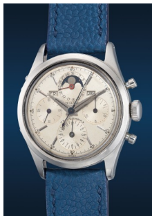
876 Universal A rare and attractive stainless s... Estimate HK$50,000 — 80,000