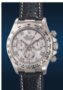
906 Rolex A fine and attractive white gold ... Estimate HK$200,000 — 400,000