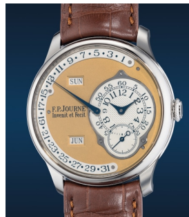
817 F.P. Journe An exceptionally fine limited edi... Estimate HK$480,000 — 960,000