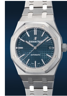
914 Audemars Piguet A fine and attractive stainless st... Estimate HK$195,000 — 275,000