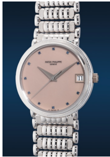
992 Patek Philippe An extremely rare and attractiv... Estimate HK$100,000 — 150,000