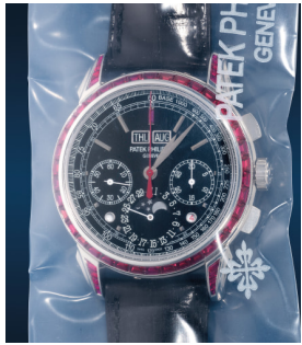
961 Patek Philippe A very rare and desirable platin... Estimate HK$2,000,000 — 3,500,000

Hong Kong Auction / 24 November 2023 / 3pm HKT