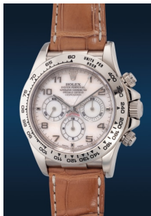
947 Rolex A rare and attractive white gold ... Estimate HK$160,000 — 310,000