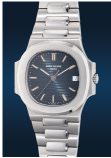
981 Patek Philippe A fine and attractive stainless st... Estimate HK$200,000 — 400,000

Hong Kong Auction / 24 November 2023 / 3pm HKT