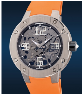
911 Richard Mille A fine and attractive white gold ... Estimate HK$280,000 — 500,000

Hong Kong Auction / 24 November 2023 / 3pm HKT