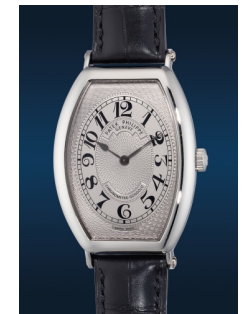
970 Patek Philippe A fine and attractive platinum t... Estimate HK$75,000 — 150,000