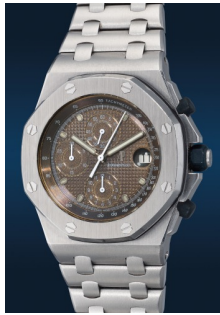
812 Audemars Piguet A rare and attractive stainless s... Estimate HK$120,000 — 200,000