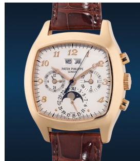
1008 Patek Philippe The only known fine and rare pi... Estimate HK$1,350,000 — 1,850,000