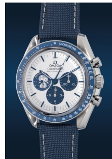
878 Omega An attractive and "like-new" sp... Estimate HK$50,000 — 100,000