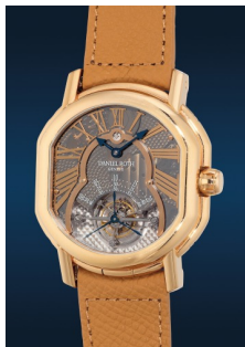
926 Daniel Roth A fine, mesmerizing, and rare se... Estimate HK$200,000 — 400,000