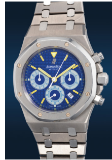
913 Audemars Piguet A fine and rare limited edition ti... Estimate HK$150,000 — 250,000