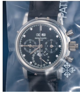
933 Patek Philippe A highly important, rare and un... Estimate HK$1,950,000 — 2,750,000