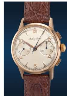
988 Mathey-Tissot A rare and well-preserved pink ... Estimate HK$30,000 — 50,000