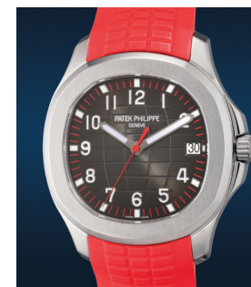
910 Patek Philippe A highly rare and attractive limi... Estimate HK$550,000 — 1,100,000