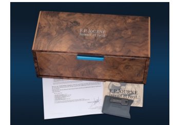
820 F.P. Journe A wooden presentation box with... Estimate HK$80,000 — 160,000