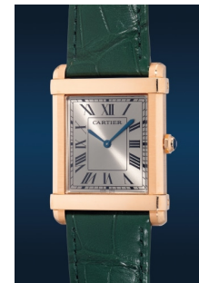
919 Cartier A rare and elegant limited editio... Estimate HK$95,000 — 155,000