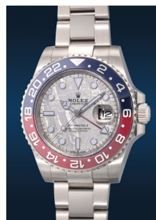
907 Rolex A fine and attractive white gold ... Estimate HK$200,000 — 400,000