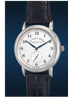
934 A. Lange & Söhne A fine and elegant platinum wri... Estimate HK$75,000 — 150,000