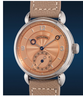
892 Voutilainen An extremely fine and mesmeriz... Estimate HK$500,000 — 1,000,000