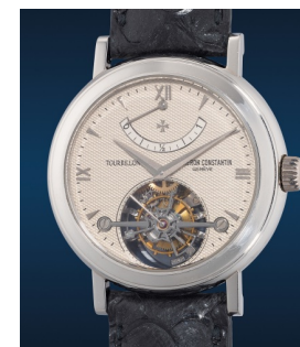
860 Vacheron Constantin A rare and well-preserved limite... Estimate HK$200,000 — 400,000