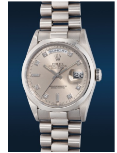
835 Rolex A fine and attractive platinum w... Estimate HK$90,000 — 180,000