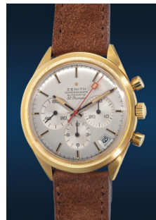
877 Zenith A very well-preserved and rare y... Estimate HK$60,000 — 120,000