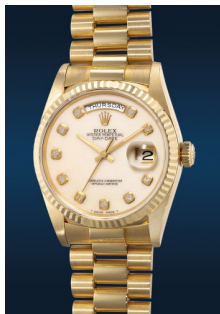
867 Rolex An incredibly rare and exquisite ... Estimate HK$150,000 — 300,000