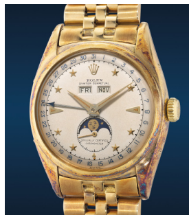
903 Rolex A highly attractive, beautifully p... Estimate HK$5,500,000 — 11,000,000