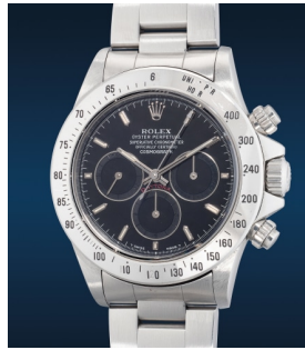
833 Rolex A very rare and attractive stainl... Estimate HK$390,000 — 780,000