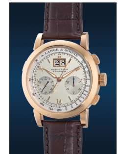
950 A. Lange & Söhne A very fine and attractive pink g... Estimate HK$250,000 — 500,000