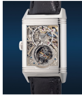
973 Jaeger-LeCoultre A rare and complicated limited ... Estimate HK$550,000 — 1,100,000