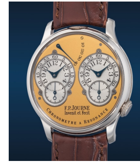
924 F.P. Journe An important, rare and attractiv... Estimate HK$1,000,000 — 2,000,000