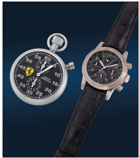
836 Girard Perregaux A fine limited edition white gold ... Estimate HK$180,000 — 390,000