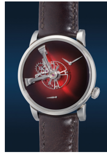
963 H. Moser & Cie X M... A very fine and rare limited editi... Estimate HK$240,000 — 480,000