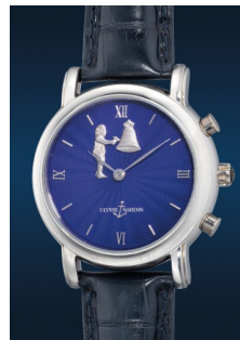
967 Ulysse Nardin An extremely fine and rare num... Estimate HK$95,000 — 170,000