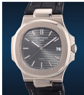
901 Patek Philippe A rare and attractive white gold ... Estimate HK$550,000 — 1,180,000

Hong Kong Auction / 24 November 2023 / 3pm HKT