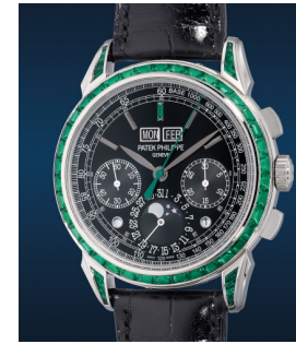
864 Patek Philippe A very rare and elegant platinu... Estimate HK$2,200,000 — 3,800,000