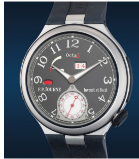
912 F.P. Journe A fine and attractive aluminum ... Estimate HK$300,000 — 500,000