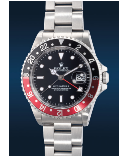
945 Rolex A fine and well-preserved stainl... Estimate HK$80,000 — 160,000