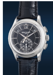
928 Patek Philippe A rare and attractive platinum a... Estimate HK$280,000 — 480,000