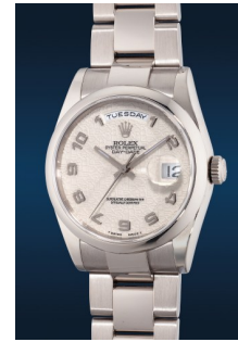
834 Rolex A rare and unusual white gold w... Estimate HK$100,000 — 200,000