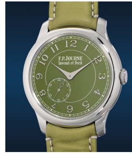
893 F.P. Journe A rare and sought-after limited e... Estimate HK$400,000 — 780,000