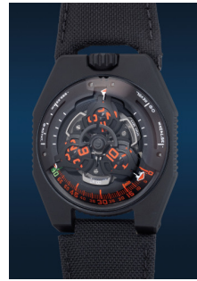
1003 Urwerk A rare and cutting edge limited ... Estimate HK$240,000 — 400,000