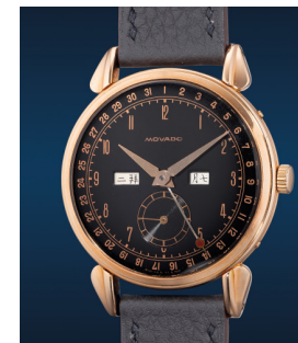
855 Movado A rare and early pink gold triple ... Estimate HK$48,000 — 95,000