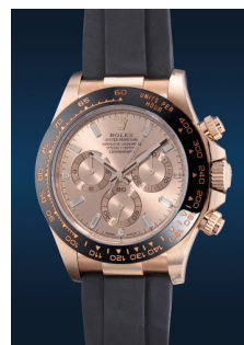
908 Rolex A fine and attractive Everose go... Estimate HK$120,000 — 200,000