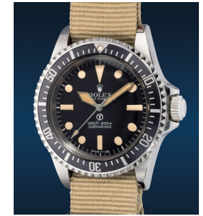
895 Rolex An extremely rare and importan... Estimate HK$1,950,000 — 3,900,000