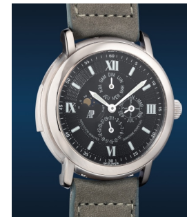
979 Audemars Piguet A very fine, rare and complicate... Estimate HK$320,000 — 650,000