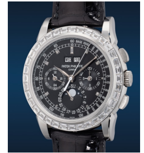
850 Patek Philippe An extremely attractive and rar... Estimate HK$1,300,000 — 1,950,000