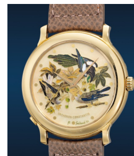
859 Vacheron Constantin An exquisite and divine limited e... Estimate HK$200,000 — 400,000