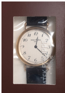
1007 Patek Philippe A lady's fine and elegant "brand... Estimate HK$80,000 — 160,000