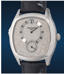
891 Patek Philippe An exceptional and rare limited ... Estimate HK$2,500,000 — 4,700,000

Hong Kong Auction / 24 November 2023 / 3pm HKT