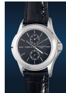
929 Patek Philippe A fine and rare limited edition pl... Estimate HK$240,000 — 400,000