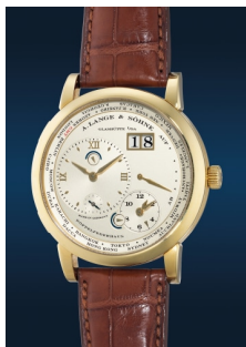
951 A. Lange & Söhne A fine and attractive yellow gold... Estimate HK$160,000 — 240,000

Hong Kong Auction / 24 November 2023 / 3pm HKT