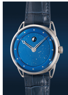
937 De Bethune A rare and impressive white gol... Estimate HK$190,000 — 380,000