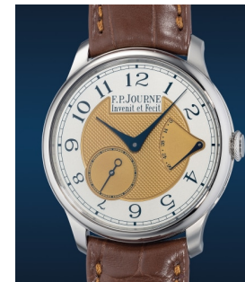
819 F.P. Journe A ravishing stainless steel wrist... Estimate HK$320,000 — 640,000