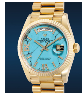
805 Rolex A "like-new" rare and attractive ... Estimate HK$180,000 — 360,000