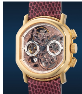
827 Daniel Roth A possibly unique and mesmeriz... Estimate HK$200,000 — 400,000