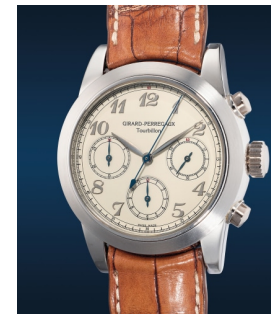
949 Girard Perregaux A very rare and attractive platin... Estimate HK$150,000 — 250,000