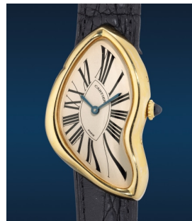
918 Cartier An unusual, impressive and icon... Estimate HK$550,000 — 1,200,000