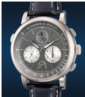
936 A. Lange & Söhne A rare, impressive and highly at... Estimate HK$600,000 — 1,000,000