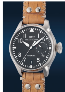
977 IWC A fine and oversized stainless st... Estimate HK$40,000 — 80,000