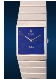
969 Rolex An extremely attractive and rar... Estimate HK$100,000 — 200,000