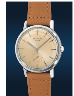
990 Patek Philippe A sleek, attractive and well pres... Estimate HK$100,000 — 200,000