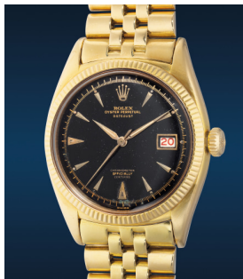
996 Rolex A exceedingly rare and attractiv... Estimate HK$350,000 — 700,000