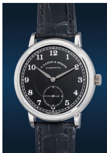
852 A. Lange & Söhne A fine and attractive limited edit... Estimate HK$160,000 — 320,000