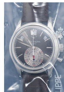
809 Patek Philippe A rare and sporty platinum ann... Estimate HK$235,000 — 470,000