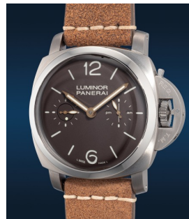
978 Panerai A rare and attractive limited edi... Estimate HK$160,000 — 240,000