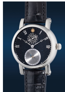
938 Christiaan van der Kla... An unusual and attractive stainl... Estimate HK$80,000 — 200,000