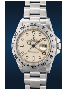
944 Rolex A rare and well-preserved stainl... Estimate HK$65,000 — 150,000