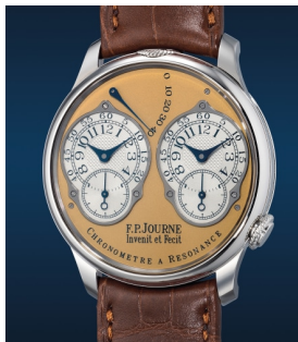
816 F.P. Journe An impressive and highly desira... Estimate HK$950,000 — 1,550,000