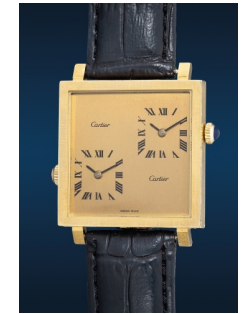
995 Cartier A very rare and unusual yellow ... Estimate HK$80,000 — 160,000