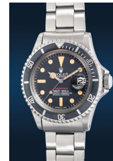
999 Rolex A rare and attractive stainless s... Estimate HK$120,000 — 200,000