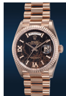
909 Rolex An attractive and rare Everose g... Estimate HK$220,000 — 460,000