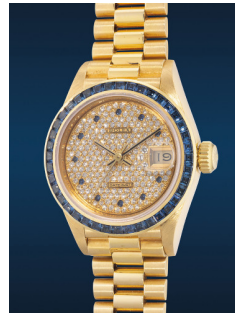
943 Rolex A lady's rare, well-preserved an... Estimate HK$100,000 — 200,000