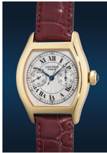
847 Cartier A fine and attractive yellow gold... Estimate HK$80,000 — 160,000