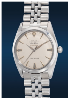
997 Rolex A highly rare and unusual stainl... Estimate HK$35,000 — 55,000