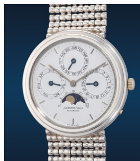
857 Audemars Piguet A very rare and attractive platin... Estimate HK$80,000 — 160,000