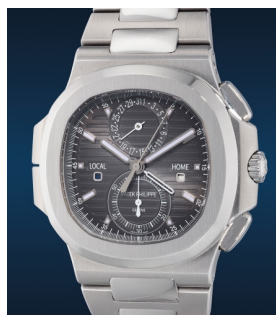
806 Patek Philippe A rare and attractive stainless s... Estimate HK$400,000 — 800,000