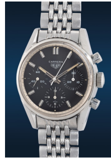
873 Heuer A very fine and attractive stainl... Estimate HK$50,000 — 80,000