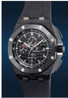
837 Audemars Piguet A rare and attractive forged car... Estimate HK$120,000 — 200,000