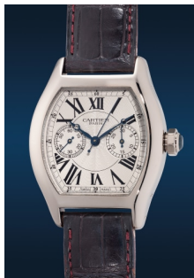
966 Cartier A fine and attractive white gold ... Estimate HK$80,000 — 150,000