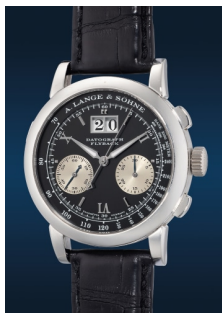
851 A. Lange & Söhne An early, rare and attractive pla... Estimate HK$250,000 — 450,000

Hong Kong Auction / 24 November 2023 / 3pm HKT