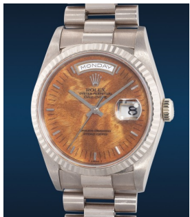
946 Rolex A well-preserved and rare white ... Estimate HK$200,000 — 400,000