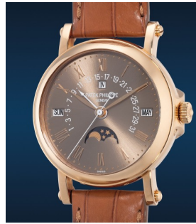
842 Patek Philippe A highly rare and attractive pink... Estimate HK$630,000 — 1,250,000