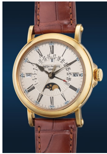
862 Patek Philippe A highly rare, attractive and wel... Estimate HK$200,000 — 320,000