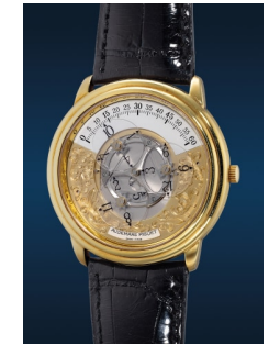
825 Audemars Piguet A rare and attractive yellow gol... Estimate HK$160,000 — 240,000