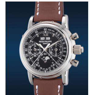
880 Patek Philippe A possibly unique, very importa... Estimate HK$2,600,000 — 5,200,000