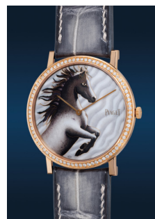
958 Piaget An exquisite and celebratory lim... Estimate HK$160,000 — 320,000