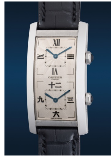
822 Cartier A highly rare, exceptional and “... Estimate HK$200,000 — 300,000