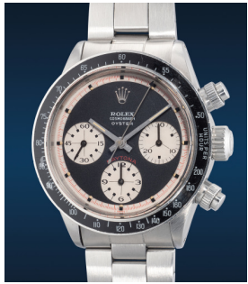
1001 Rolex An extremely rare and well-pres... Estimate HK$3,500,000 — 5,500,000

Hong Kong Auction / 24 November 2023 / 3pm HKT