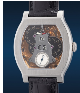
823 F.P. Journe A very fine and rare limited editi... Estimate HK$620,000 — 1,250,000