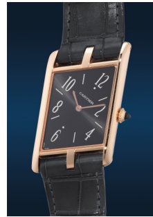
848 Cartier A rare and attractive limited edi... Estimate HK$120,000 — 200,000