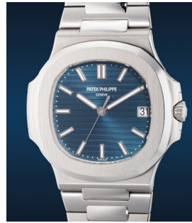
983 Patek Philippe An incredibly rare and attractive... Estimate HK$3,900,000 — 7,800,000