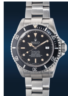
898 Rolex A very rare and attractive stainl... Estimate HK$120,000 — 200,000