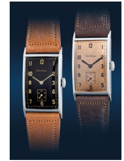
985 Certina A very attractive and well-prese... Estimate HK$15,000 — 25,000