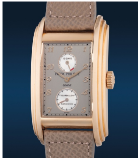
921 Patek Philippe A very fine and rare pink gold re... Estimate HK$700,000 — 1,400,000

Hong Kong Auction / 24 November 2023 / 3pm HKT