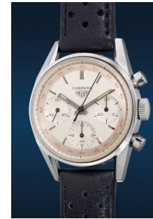
874 Heuer A fine and attractive stainless st... Estimate HK$40,000 — 60,000