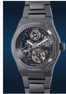
838 Girard Perregaux An extremely attractive and "lik... Estimate HK$120,000 — 200,000