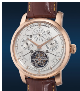
952 Vacheron Constantin A highly rare and impressive pin... Estimate HK$800,000 — 1,600,000