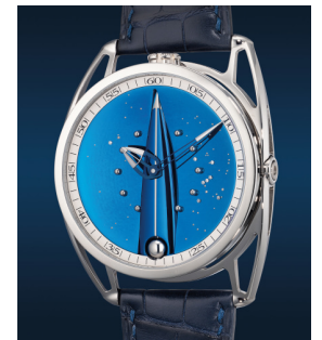
1010 De Bethune An extremely fine and rare grad... Estimate HK$500,000 — 1,000,000