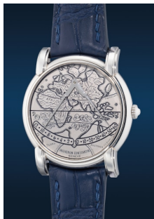
916 Vacheron Constantin A very fine and rare platinum wr... Estimate HK$160,000 — 310,000