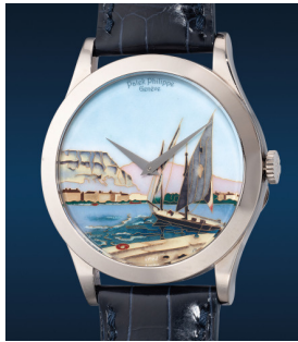
931 Patek Philippe A highly attractive and comme... Estimate HK$800,000 — 1,600,000

Hong Kong Auction / 24 November 2023 / 3pm HKT