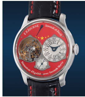
962 E.P. Journe An extremely rare, highly covete... Estimate HK$6,000,000 — 10,000,000