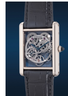
829 Cartier A rare and attractive white gold ... Estimate HK$160,000 — 300,000