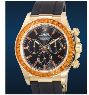
865 Rolex A striking, rare yellow gold and ... Estimate HK$1,200,000 — 2,200,000