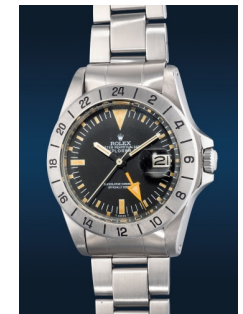
1000 Rolex A fine and rare stainless steel wr... Estimate HK$120,000 — 200,000