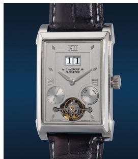
853 A. Lange & Söhne A fine and elegant platinum rect... Estimate HK$400,000 — 800,000