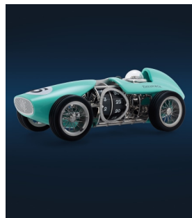
902 Tiffany & Co. An incredibly rare and special li... Estimate HK$160,000 — 320,000