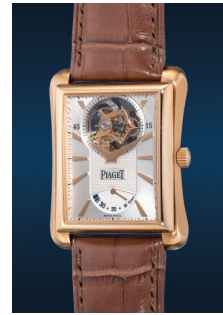
923 Piaget A fine and attractive numbered ... Estimate HK$95,000 — 150,000