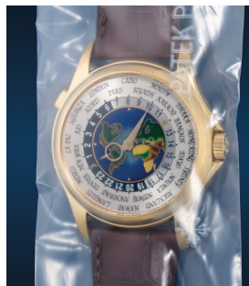
953 Patek Philippe A very fine and rare yellow gold ... Estimate HK$550,000 — 1,100,000