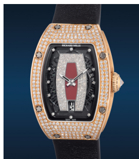
956 Richard Mille A rare and dazzling lady's pink g... Estimate HK$450,000 — 950,000