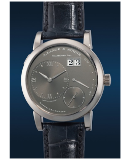
935 A. Lange & Söhne A fine and elegant white gold wr... Estimate HK$200,000 — 350,000