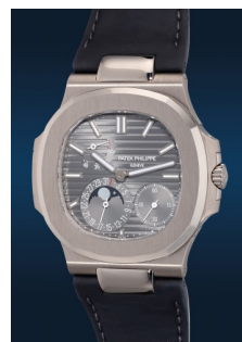
808 Patek Philippe A fine and rare white gold wrist... Estimate HK$300,000 — 600,000