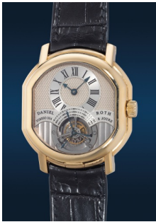
846 Daniel Roth A fine and elegant pink gold tou... Estimate HK$240,000 — 400,000