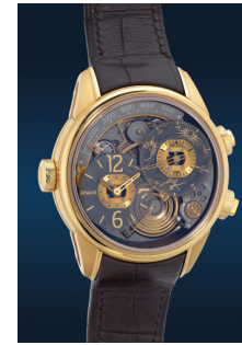
964 Breva A large and impressive limited e... Estimate HK$160,000 — 320,000