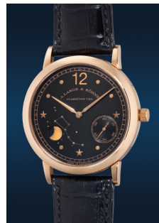
927 A. Lange & Söhne A fine and rare limited edition pi... Estimate HK$120,000 — 320,000