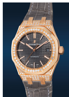
957 Audemars Piguet A very attractive pink gold and ... Estimate HK$160,000 — 280,000