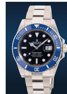
905 Rolex A rare and "brand-new" white g... Estimate HK$150,000 — 300,000