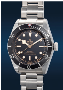
976 Tudor A fine and attractive stainless st... Estimate HK$20,000 — 40,000