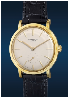
991 Patek Philippe A fine and attractive yellow gold... Estimate HK$70,000 — 140,000

Hong Kong Auction / 24 November 2023 / 3pm HKT