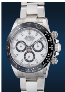
801 Rolex A fine and attractive stainless st... Estimate HK$95,000 — 160,000