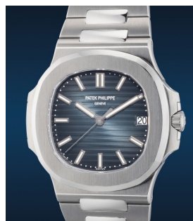
807 Patek Philippe A rare and attractive stainless s... Estimate HK$310,000 — 625,000