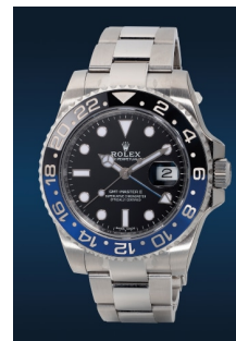
904 Rolex A "new-old-stock" and attractiv... Estimate HK$50,000 — 100,000