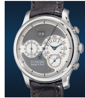
844 F.P. Journe An exclusive, striking, and unus... Estimate HK$550,000 — 1,100,000