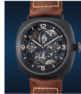
839 Panerai A very fine and attractive limite... Estimate HK$160,000 — 320,000