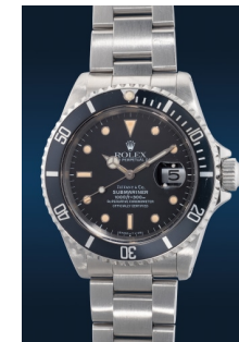
899 Rolex A rare and attractive stainless s... Estimate HK$120,000 — 200,000