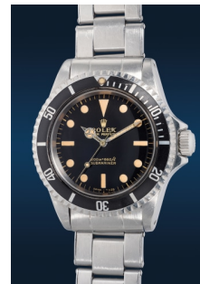
998 Rolex A well-preserved stainless steel ... Estimate HK$160,000 — 320,000