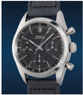
831 Rolex A very rare and attractive stainl... Estimate HK$700,000 — 1,400,000

Hong Kong Auction / 24 November 2023 / 3pm HKT