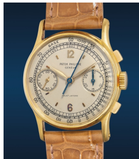
986 Patek Philippe An attractive and well-preserve... Estimate HK$250,000 — 450,000