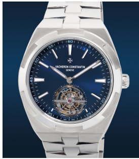
811 Vacheron Constantin A handsome and rare stainless s... Estimate HK$300,000 — 600,000

Hong Kong Auction / 24 November 2023 / 3pm HKT