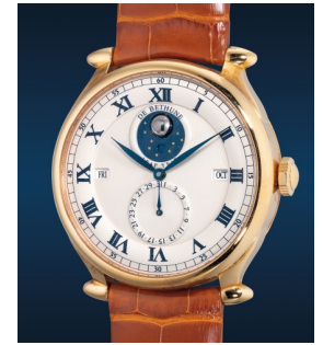
845 De Bethune A rare and innovative pink gold ... Estimate HK$240,000 — 480,000