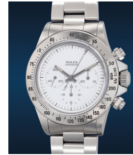
974 Rolex A historically important stainles... Estimate HK$800,000 — 1,200,000