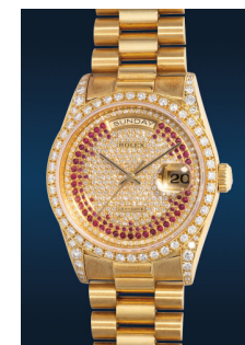
960 Rolex An impressive and extravagant ... Estimate HK$200,000 — 400,000