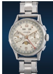
987 Leonidas A very rare and well-preserved s... Estimate HK$30,000 — 50,000