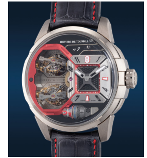
965 Harry Winston A highly rare and impressive lim... Estimate HK$640,000 — 960,000