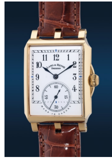
922 Lang & Heyne A fine and rare pink gold rectan... Estimate HK$65,000 — 130,000