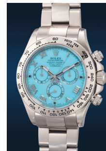
804 Rolex A rare and attractive white gold ... Estimate HK$200,000 — 400,000