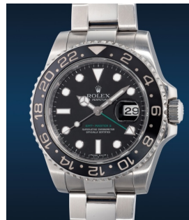
868 Rolex An extremely rare and importan... Estimate HK$250,000 — 400,000