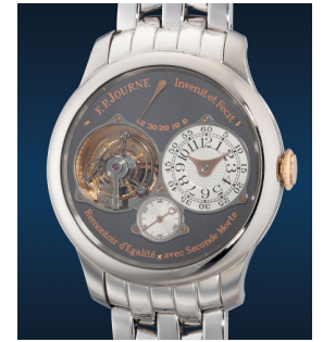
1005 F.P. Journe An extremely rare and highly co... Estimate HK$1,600,000 — 3,200,000