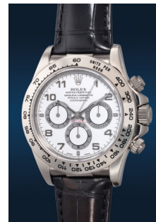
948 Rolex A fine and attractive white gold ... Estimate HK$150,000 — 250,000