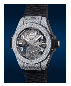
8126 Hublot A very rare and attractive limite... Estimate HK$200,000 — 400,000

8125 Omega A fine and attractive limited edit... Estimate HK$40,000 — 65,000