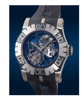
8114 Roger Dubuis A very fine and unique titanium ... Estimate HK$160,000 — 320,000