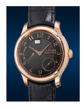
8005 F.P. Journe An attractive, rare and highly de... Estimate HK$350,000 — 650,000

8004 F.P. Journe An attractive and innovative pla... Estimate HK$400,000 — 700,000