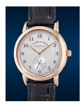
8053 A. Lange & Söhne An attractive and elegant pink g... Estimate HK$80,000 – 160,000