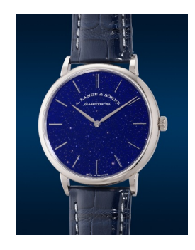
8051 A. Lange & Söhne A rare and attractive white gold ... Estimate HK$95,000 – 160,000