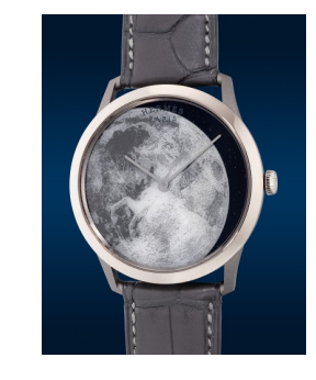
8062 Hermès A rare and elegant limited editio... Estimate HK$50,000 – 100,000