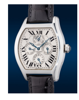
8102 Cartier A fine and rare platinum tonnea... Estimate HK$150,000 — 250,000