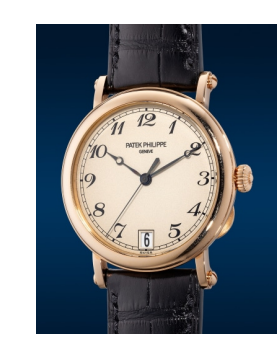
8012 Patek Philippe A fine and elegant pink gold wri... Estimate HK$40,000 - 60,000

8011 Rolex A rare and attractive white gold ... Estimate HK$240,000 — 480,000