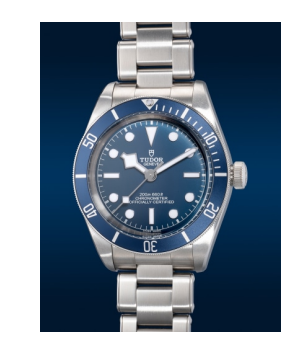
8122 Tudor An attractive and "like-new" sta... Estimate HK$20,000 — 40,000

8121 IWC A fine, large and well-preserved ... Estimate HK$50,000 — 95,000