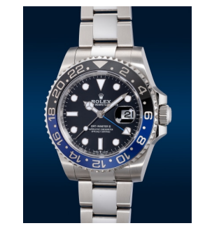
8002 Rolex A fine and attractive stainless st... Estimate HK$50,000 — 100,000

8001 Rolex A fine and attractive stainless st... Estimate HK$100,000 — 200,000