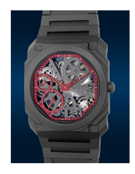
8075 Bulgari A "like-new" and ultra-slim limit... Estimate HK$80,000 — 160,000

8074 Audemars Piguet A rare and oversized limited edit... Estimate HK$120,000 - 220,000