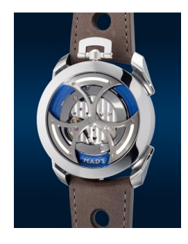
8085 M.A.D. Editions An avant-garde and extraordin... Estimate HK$16,000 - 32,000

8084 De Bethune An avant-garde and impressive ... Estimate HK$160,000 — 320,000