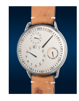
8082 Ressence An unusual and avant-garde tit... Estimate HK$40,000 — 80,000