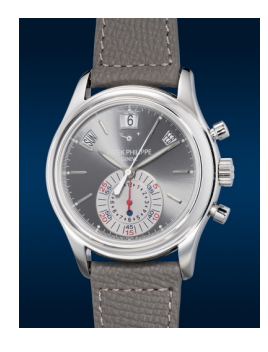
8025 Patek Philippe A rare and sporty platinum ann... Estimate HK$240,000 — 400,000

8024 Cartier A fine and elegant white gold an... Estimate HK$62,000 – 140,000