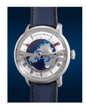
8101 Arnold & Son A rare and attractive stainless s... Estimate HK$120,000 — 240,000