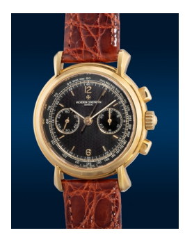
8055 Vacheron Constantin A fine and elegant yellow gold c... Estimate HK$120,000 — 200,000

8054 Vacheron Constantin A very fine and rare yellow gold ... Estimate HK$120,000 — 250,000