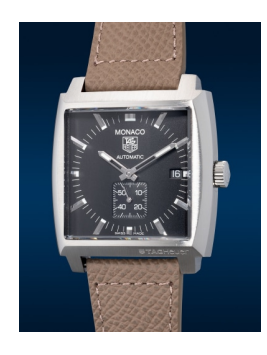
8071 TAG Heuer A fine and attractive stainless st... Estimate HK$8,000 - 12,000