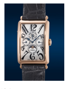
8104 Franck Muller A fine and rare pink gold rectan... Estimate HK$70,000 — 140,000