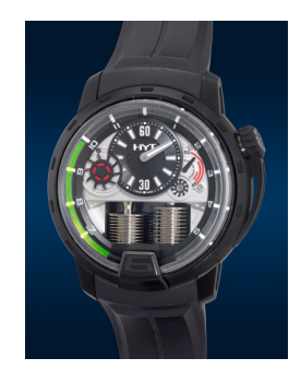
8065 HYT A fine and futuristic DLC-coated... Estimate HK$80,000 — 160,000