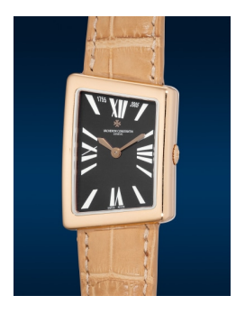
8107 Vacheron Constantin A rare and attractive limited edi... Estimate HK$40,000 - 80,000