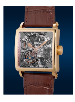
8105 Roger Dubuis A rare and attractive limited edi... Estimate HK$160,000 — 320,000