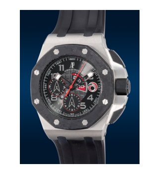
8072 Audemars Piguet A fine and rare limited edition pl... Estimate HK$200,000 — 360,000