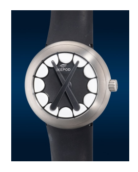
8081 KAWS x Ikepod Horizon A rare and playful titanium wris... Estimate HK$78,000 – 160,000