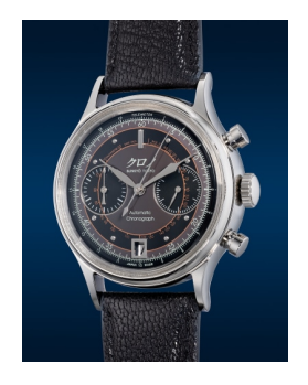
8113 Kurono Tokyo A very attractive and limited edi... Estimate HK$8,000 - 16,000