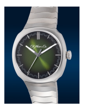
8066 H. Moser & Cie A fine, attractive and well-prese... Estimate HK$70,000 – 140,000