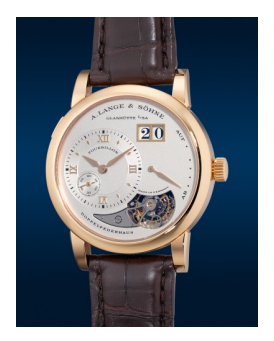
8006 A. Lange & Söhne A very fine and rare limited editi...