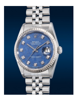
8035 Rolex An attractive and fine stainless ... Estimate HK$60,000 — 120,000

8034 Rolex A fine and attractive white gold ... Estimate HK$160,000 — 240,000