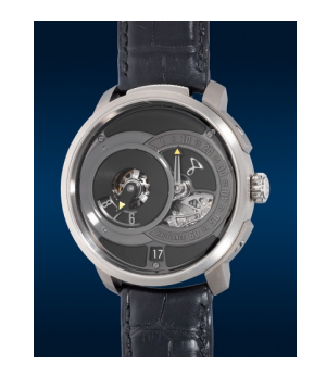
8064 Hautlence A very unusual and attractive li... Estimate HK$120,000 — 240,000