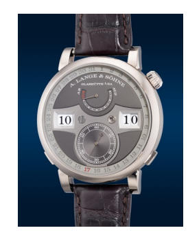
8007 A. Lange & Söhne A rare and attractive white gold ... Estimate HK$400,000 — 625,000