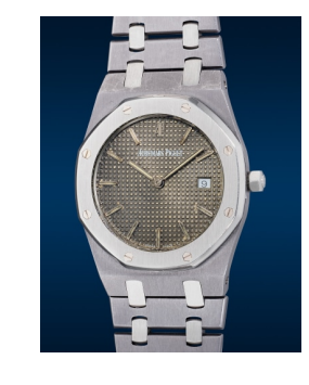
8032 Audemars Piguet A fine and attractive limited edit... Estimate HK$50,000 - 80,000