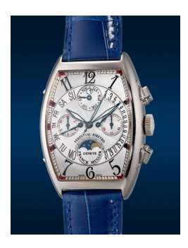
8103 Franck Muller A fine and attractive white gold ... Estimate HK$60,000 — 120,000