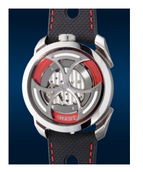
8086 M.A.D. Editions An avant-garde and extraordin... Estimate HK$16,000 - 32,000