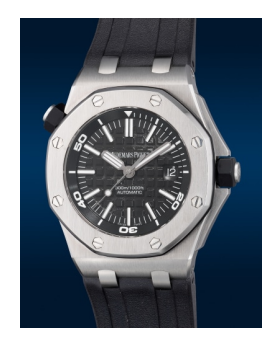
8116 Audemars Piguet A fine and attractive stainless st... Estimate HK$78,000 – 160,000