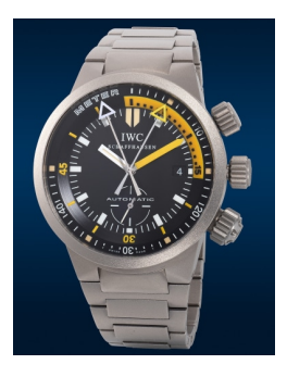
8120 IWC A rare and attractive titanium di... Estimate HK$50,000 — 95,000

8119 Zenith A playful, "like-new" and impres... Estimate HK$40,000 — 80,000