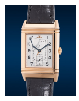
8106 Jaeger-LeCoultre A highly attractive and rare pink... Estimate HK$80,000 – 160,000