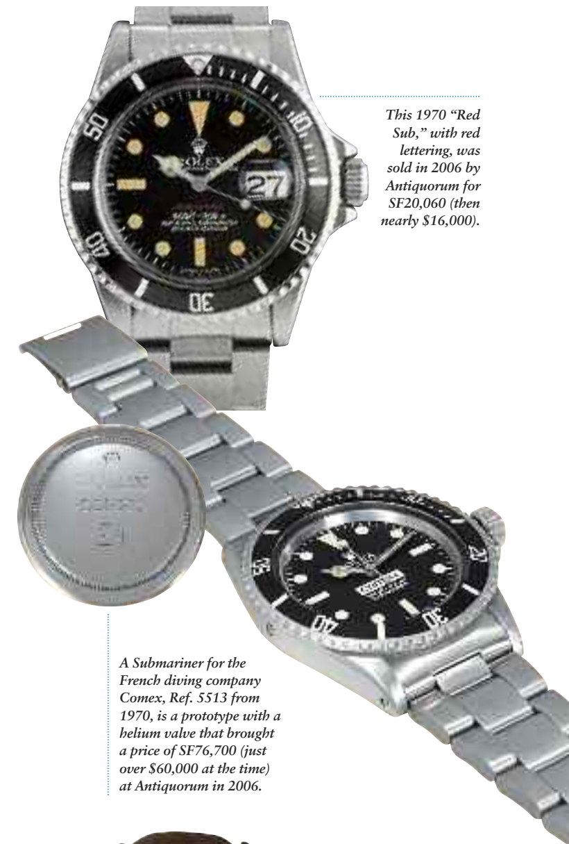
This 1970 "Red Sub," with red lettering, was sold in 2006 by Antiquorum for SF20,060 (then nearly $16,000).