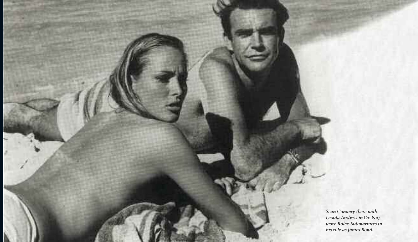
Sean Connery (here with Ursula Andress in Dr. No ) wore Rolex Submariners in his role as James Bond.