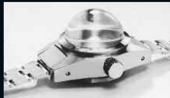
The submarine Trieste and the Rolex Deep Sea Special prototype reached the deepest point in the ocean in 1960.

In collectors' circles some early Submariner models are known as "James Bonds." And for good reason: in the first four James Bond films, Agent 007 wore Rolex watches, as he did in the novels by Ian Fleming. The watches bore the reference numbers 6200, 6538 and 5510.