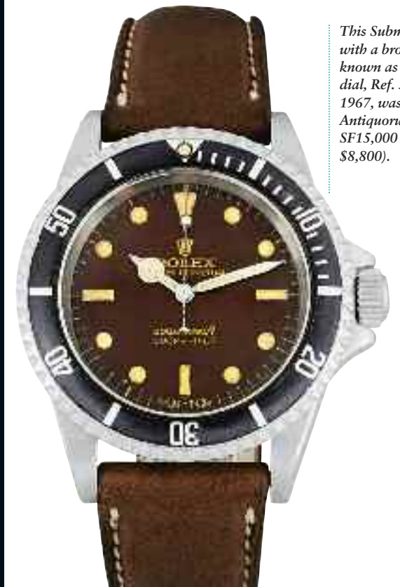
This Submariner model with a brown dial, known as the "Tropical" dial, Ref. 5513 from 1967, was auctioned by Antiquorum in 2001 for SF15,000 (then about $8,800).