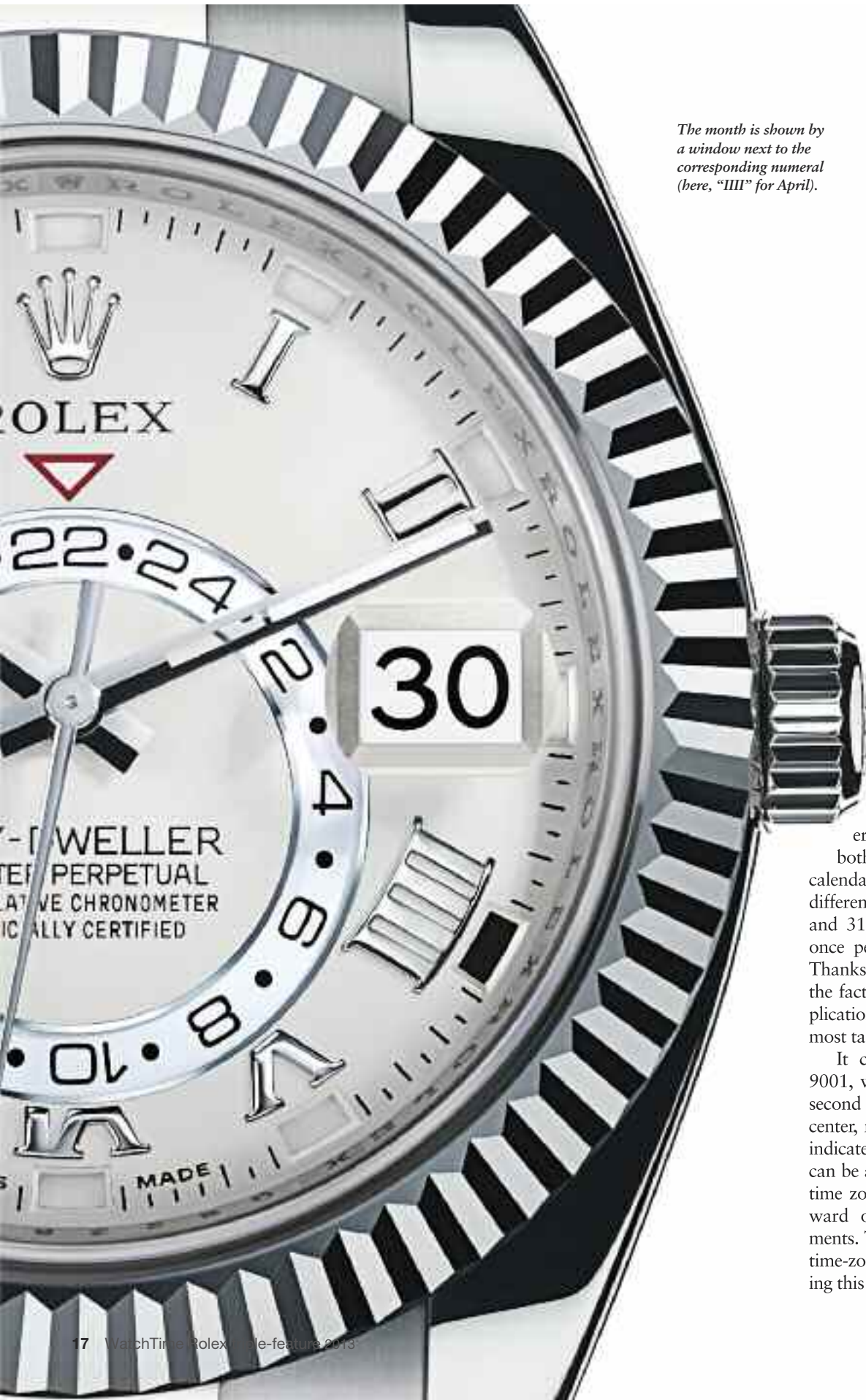
The month is shown by a window next to the corresponding numeral (here, "IIII" for April).