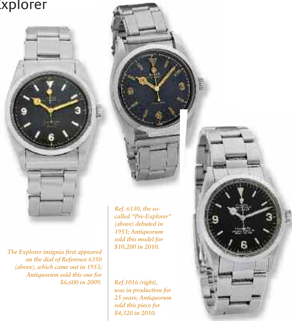
The Explorer insignia first appeared on the dial of Reference 6350 (above), which came out in 1953; Antiquorum sold this one for $6,600 in 2009.

The "Pre-Explorer" (References 6098 and 6150) debuted in 1953 with Caliber A296 and a black dial, Arabic numerals for the 3, 6 and 9, and hands with Mercedes-logo adornments. The Explorer insignia first appeared later that year, on the dial of the successor References 6298 and 6350, but pale dials were also used. Reference 6610 premiered in 1959: it contained Caliber 1030, which enabled Rolex to use a flatter back. These early Explorer models used gold as the color for the hands and minute circle. Reference 6610 was replaced in 1963 by Reference 1016, which contained Caliber 1560; the water-resistance was increased from 50 to 100 meters. This reference remained in production for a quarter of a century. Starting in 1975, it was equipped with Caliber 1570, which gave it a stop-seconds function, and massive links were used in its bracelet. The Explorer underwent major revisions in 1989: Reference 14270 had a different case, a crystal made of sapphire, applied white-gold indices with luminous material, and Caliber 3000 ticking inside its case. Reference 114270, with massive lugs and containing Caliber 3130, replaced this model in 2001. This reference was later given a crown-shaped logo lasered into the glass and a flange with the word "Rolex" engraved all around it. In 1971, Rolex's Explorer II model joined the traditional Explorer: it had an additional 24-hour display and was later given an hour hand that could be reset in hourly increments.