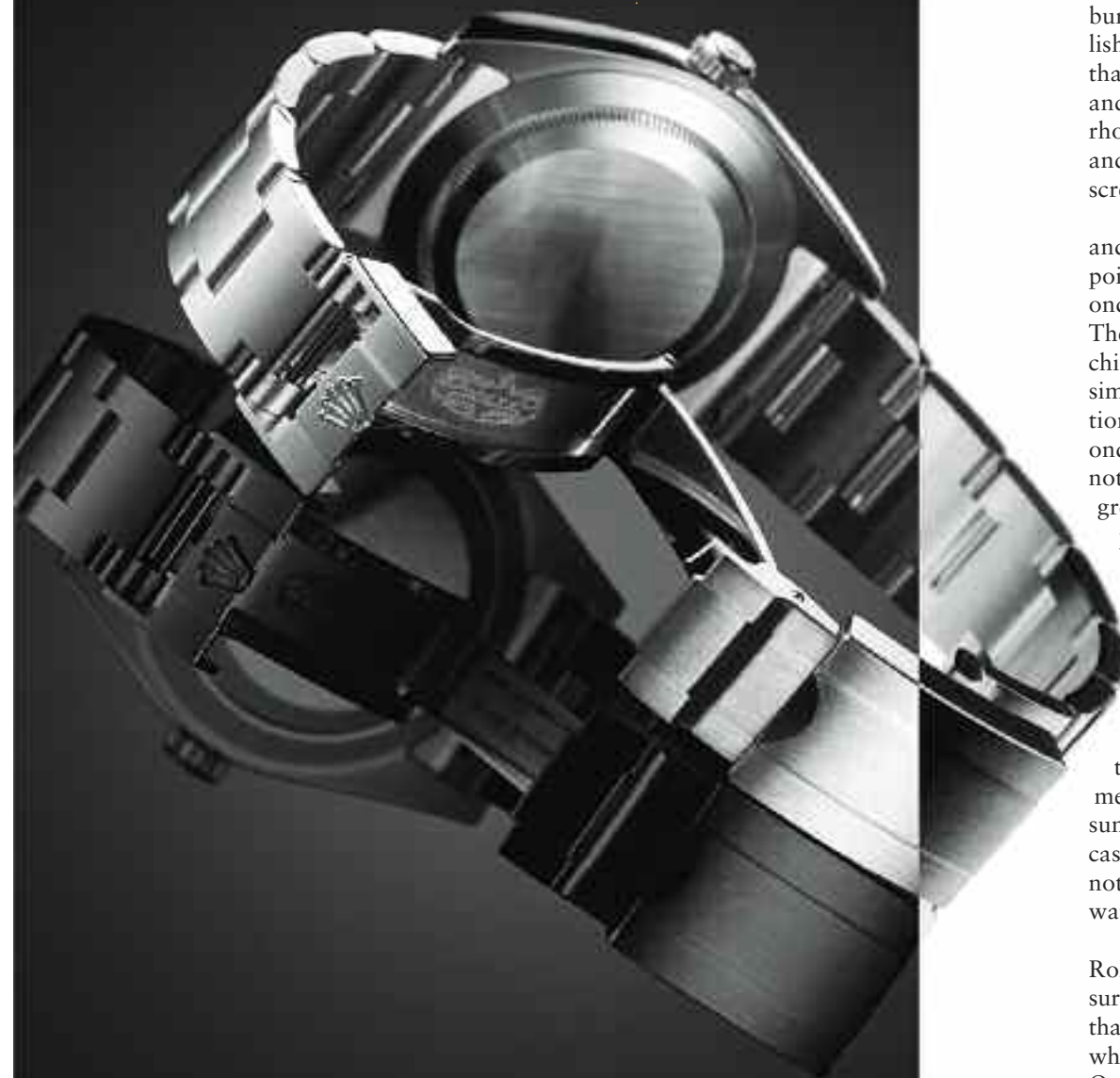
The practical folding clasp has a bracelet extender and bears Rolex's crown-shaped logo.

ability to resist deformation. Furthermore, the spring bears two markings: one for the maximum oil level and one for the minimum. The Paraflex system is another example of Rolex striving to take what's already good and make it even better.