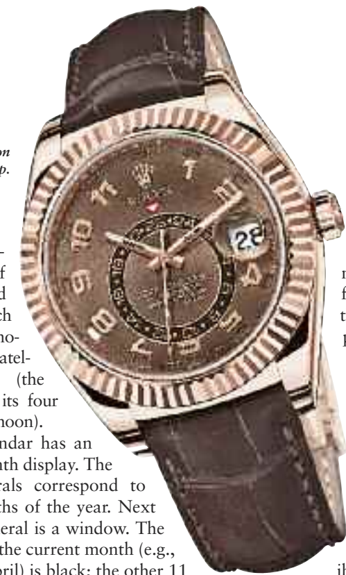
The rose-gold version has an alligator strap.

The calendar mechanism, which changes instantaneously, is relatively simple, Rolex says: the company has added just two gear ratios and four gear wheels to its existing instantaneous date calendar. As Rolex explains it, "The mechanism is designed around a fixed planetary gear wheel at the center of the movement. A satellite wheel engages with the planetary wheel and rotates, orbiting the planetary wheel in one month, driven by the date disk. The satellite wheel is fitted with four fingers for the four 30-day months (April, June, September and November).