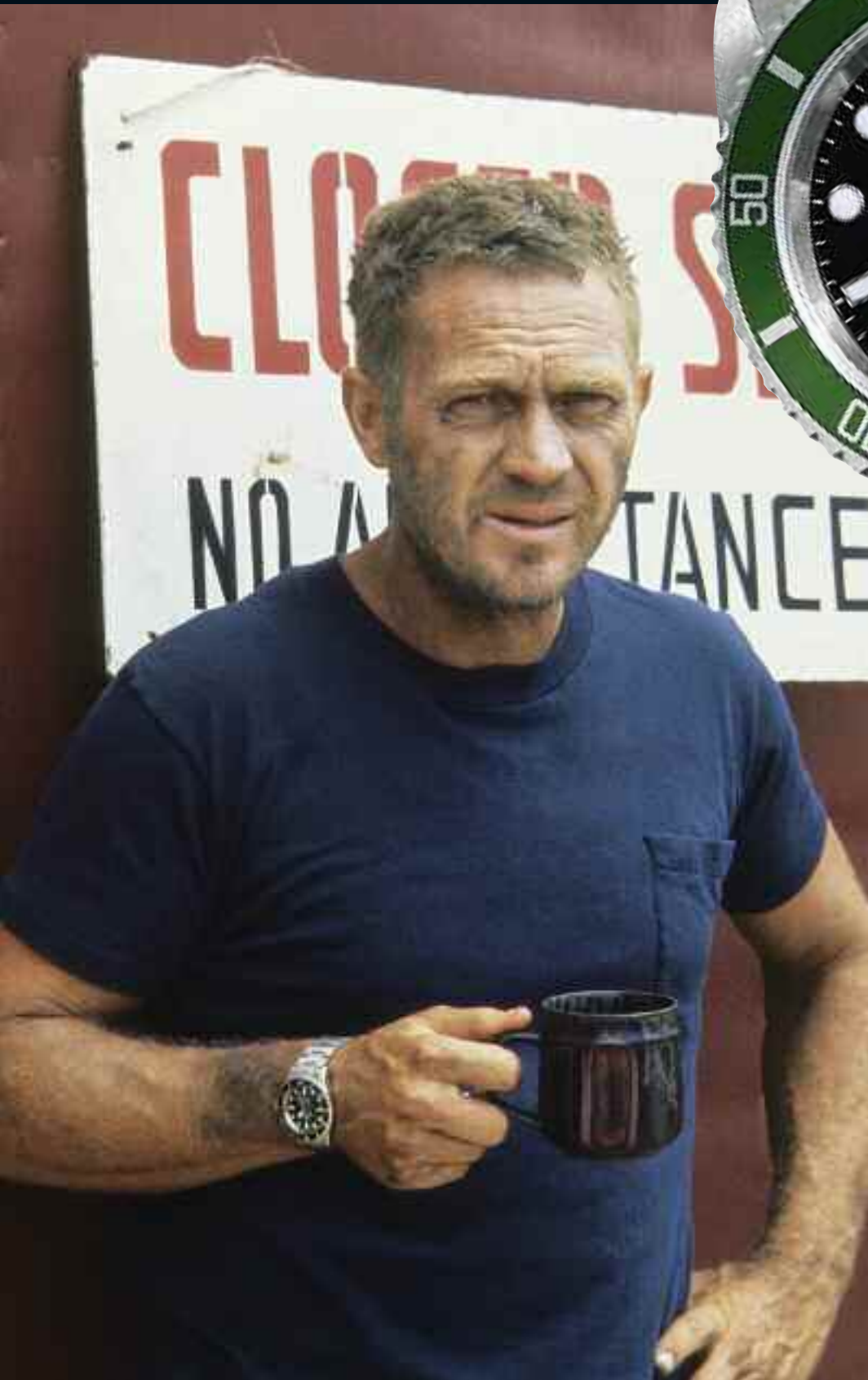
Steve McQueen wearing a Submariner during the filming of Papillon in 1973