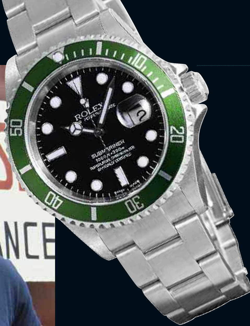
This 2002 Submariner Ref. 16610LV with green bezel, which marked the Submariner's 50th anniversary, was sold by Antiquorum in 2010 for SF5,750 (then about $5,400).

Later that decade, Rolex introduced a new dive-watch feature. It was designed to solve a problem that had emerged as a result of the introduction into professional diving of breathing gases that blended oxygen and helium. These gases enabled divers to descend deeper than before. But divers who wore their watches in decompression chambers filled with the new gas mixture often faced a rude surprise. Helium molecules penetrated the watch crystals and seals and entered the watch cases, and when the pressure in the chamber was reduced during decompression, the helium gas that had built up inside the watch was unable to escape quickly enough, so the watch crystal popped off the watch like a Champagne cork.