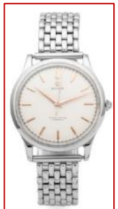
LOT 148 ROLEX, REF. 8029, OVERSIZE CENTERSECONDS, SERPICO Y LAINO CASEBACK, STEEL

Another Rolex classic, the Ref. 8029 with oversize center seconds hand , produced great results— LOT 148 , a stainless-steel wristwatch with a solid caseback, "Private Eyes" metal bracelet and double signature from Italian retailer Serpico Y Laino, sold for CHF 52,500. - (incl. buyer's premium) , well over its high estimate.