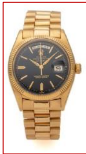
LOT 403 ROLEX, REF. 6611, DAY-DATE, YELLOW GOLD

LOT 403 & 484 , both classic Day-Date models in yellow gold ( LOT 403 with the classic fluted bezel and LOT 484 with a smooth bezel and day and date in Spanish) went under the hammer and each resulted in double their estimates, proving that the eternally classic Rolex Day-Date will remain a must-have for collectors.