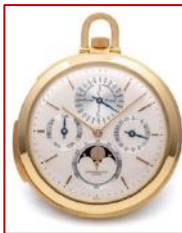
LOT 326 AUDEMARS PIGUET ASTRONOMIC MINUTE REPEATER

Sold for: CHF 112,500. - (incl. buyer’s premium)