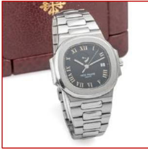
LOT 178 PATEK PHILIPPE, REF. 3710, NAUTILUS, POWER RESERVE, 150TH EVER PRODUCED, STEEL

A very fine, self-winding, stainless steel wristwatch with date and power reserve. Featuring roman numerals with luminous material as well as the characteristic power reserve that would become known as “The Comet” by collectors. Known to have launched with the movement number 3’148’000, it makes this example the 150 th piece ever produced.