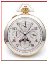
LOT 325 AUDEMARS PIGUET GRANDE COMPLICATION

Other highlights on this Sunday’s auction included pieces from Audemars Piguet , such as this trio of very fine and rare pocket watches Audemars Piguet Complications LOTS 325, 326, & 327 , and two very rare Royal Oak models. LOT 214 , a supremely well-maintained steel Royal Oak Perpetual Calendar , is a reference that owes its rarity due to the fact that during its 15 years in production, only 15 models in stainless steel were sold a year worldwide. LOT 534 , a Royal Oak Quantième Perpetuel , is a very rare example of this reference featuring a salmon dial and has also never been presented at auction before.