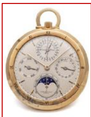
LOT 327 AUDEMARS PIGUET, REF. 5501, PERPETUAL CALENDAR POCKET WATCH, TWO-TONE DIAL, YELLOW GOLD

Sold for: CHF 100,000. - (incl. buyer’s premium)